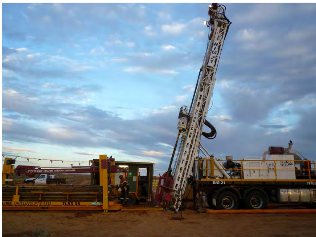
Plate 1. Drill rig on site at Oliffes Dam target.