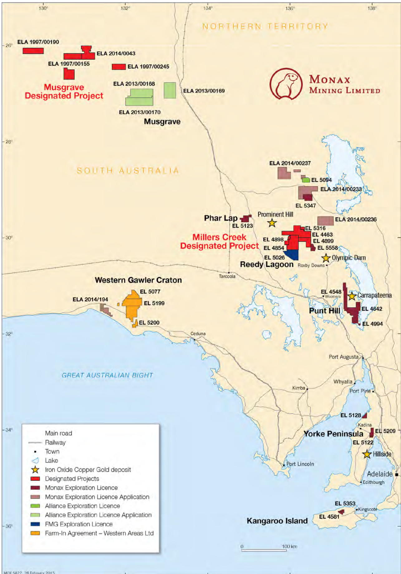
Figure 1. Location of Monax Projects including the Millers Creek Designated Project.